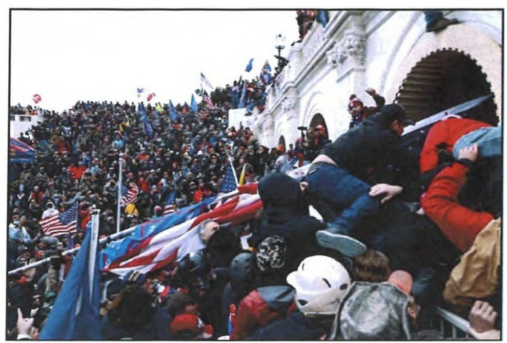
Photograph of the Capitol ou January 6, 2021m