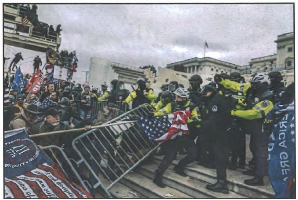
Photograph of the Capitol on January 6, 2021 116