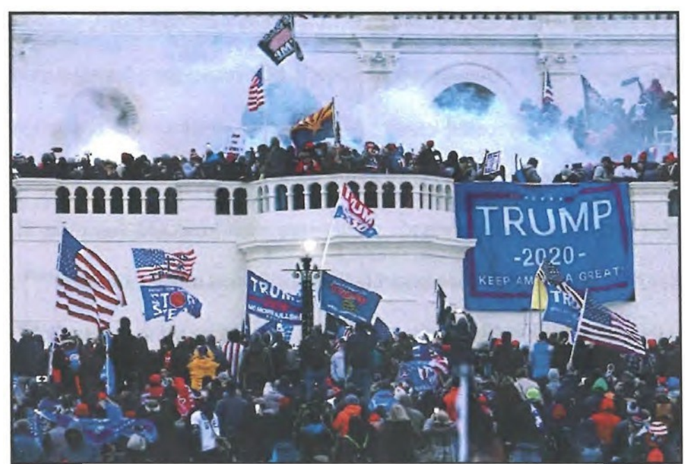
Photograph of the Capitol on January 6. 2021 112