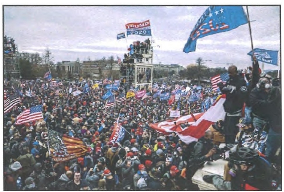
Photograph of the Capitol on January 6. 2021 113