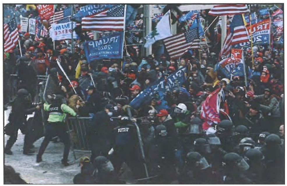
Photograph of the Capitol on January 6. 2021<sup>117</sup>

<sup>116</sup> Statement from Leaders, Updated: 'Our Children Are Watching': Nonprofit and Foundation Leaders Respond to Capitol Hill Violence, lHE CHRONICLE OF PHILANTHROPY (Jan. 7, 2021). https://www.pbilanthropy.com/article/how nonprofit-and-foUlldation-leaders-are-responding-to-capitol-bill-'\-folence.